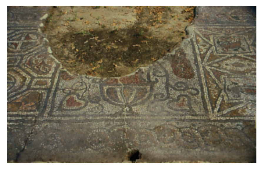
FIG.9 PHOTOGRAPH BY THE AUTHORS.